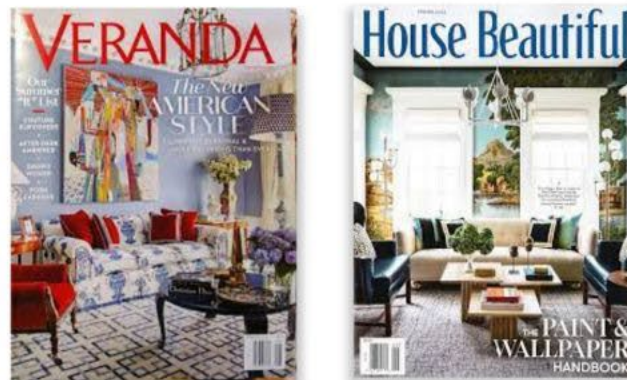
Core Shelter Media; Brand Specific & Co-Branded

What marketing channels does the Crypton marketing team focus on for brand story telling ?