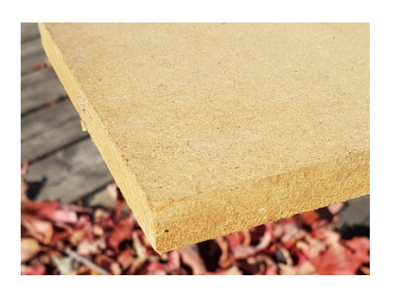
Medium Density Fibreboard (MDF)